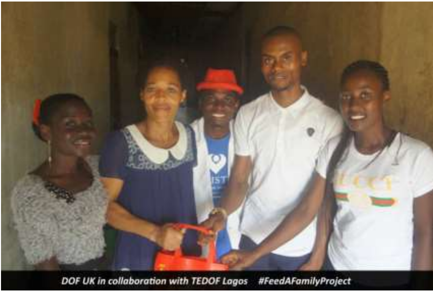
DOF UK in collaboration with TEDOF Lagos #FeedAFamilyProject