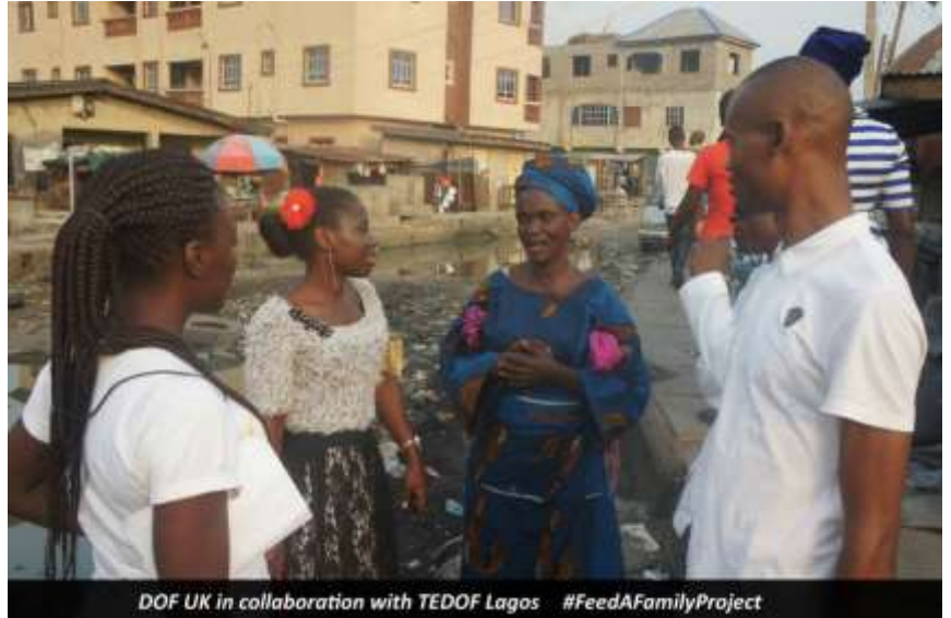
DOF UK in collaboration with TEDOF Lagos #FeedAFamilyProject