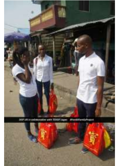
The Emmanuel Damilola Osoteku Foundation, TEDOF, Lagos team setting out to put smiles on many family faces