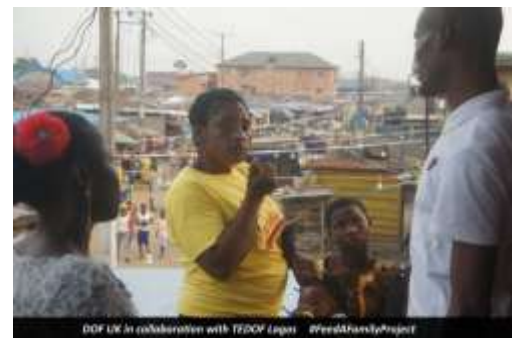
DOF UK in collaboration with TEDOF Lagos #FeedAFamilyProject