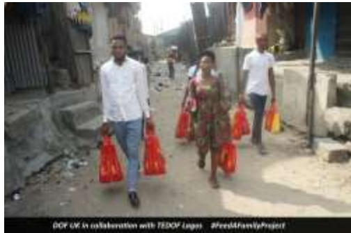
DOF UK in collaboration with TEDOF Lagos #FeedAFamilyProject