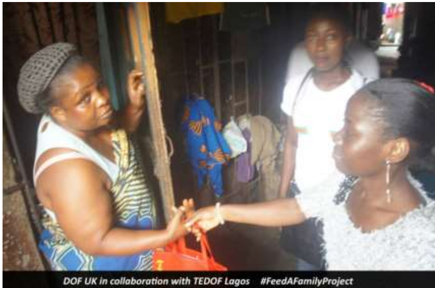
DOF UK in collaboration with TEDOF Lagos #FeedAFamilyProject